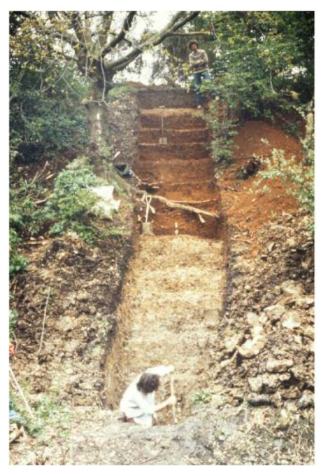
Above, excavation work at the Horncurch railway cutting site

Left, a handaxe found in Thames floodloam deposits overlying the Dartford Heath Gravel at Wansunt Pit in 2005